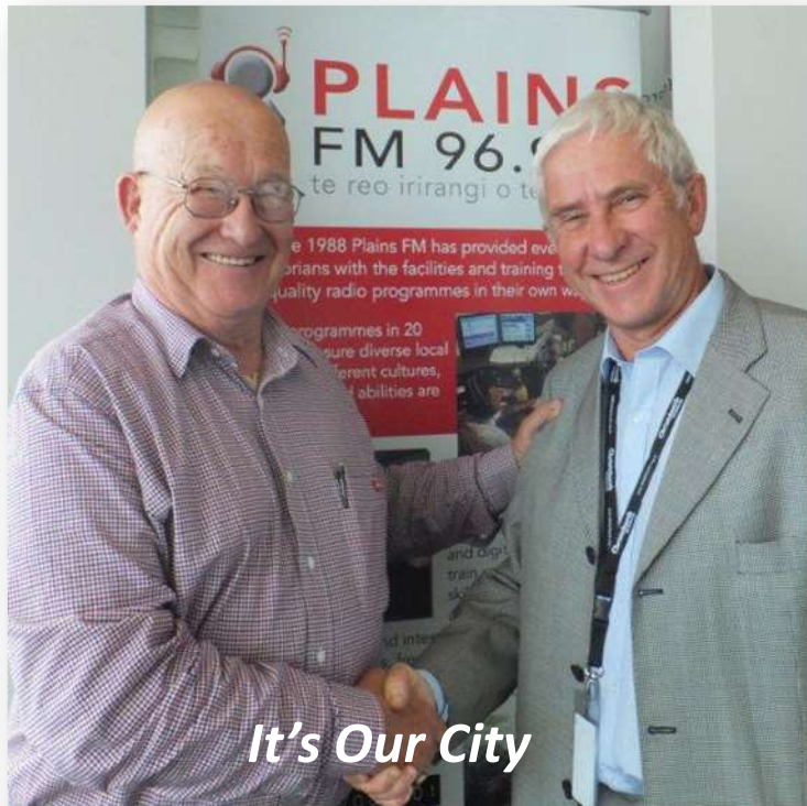
It's Our City