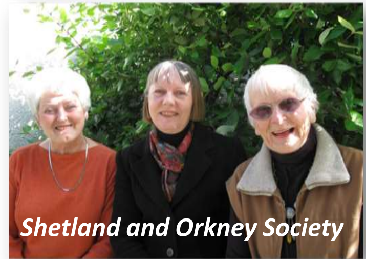
Shetland and Orkney Society